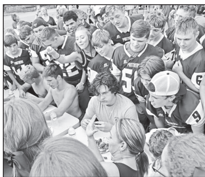
This Friday, Aug. 17, Union County High School will host its annual Meet the Team event at Mike Colwell Memorial Stadium from 5:30 p.m.