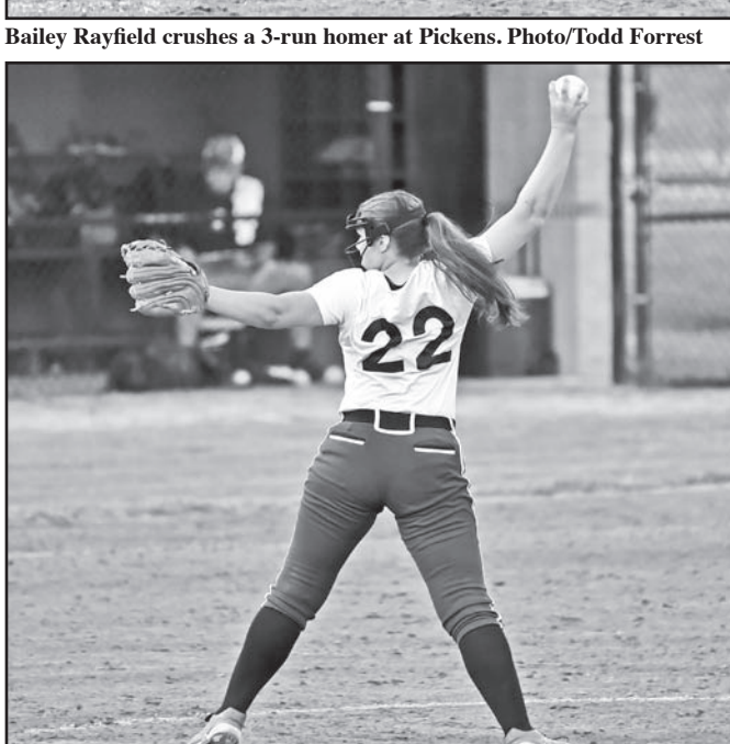
Trinity Queen recorded a win at Habersham.