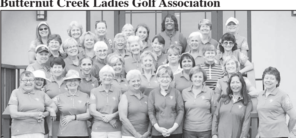
Butternut Creek Ladies Golf Association

@East Hall w/Lanier Christian V 5:00 JV 5:00